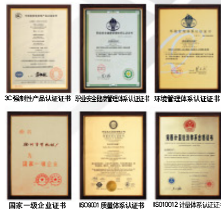
3C强制性产品认证证书 职业安全健康管理体系认证证书 环境管理体系认证证书 国家一级企业证书 ISO9001 质量体系认证证书 ISO10012 计量体系认证证书

地址: 中国江苏徐州市铜山路165号 Add.No.165 Tongshan Road Xuzhou Jiangsu China 电话(Tel): 0516-83462242 83462350 传真(Fax): 0516-83461669 邮编(Post Code): 221004 网址(URL): http://www.xzxc.com.cn E-mail: xzxyx@pub.xz.jsinfo.net 服务电话(Service Tel): 0516-83461183 服务传真(Service Fax): 0516-83461180 质量监督电话(Quality Inquiry Tel): 0516-87888268 备件电话(Spare Parts Tel): 0516-83461542 大修厂(Overhaul Factory): 0516-83461904